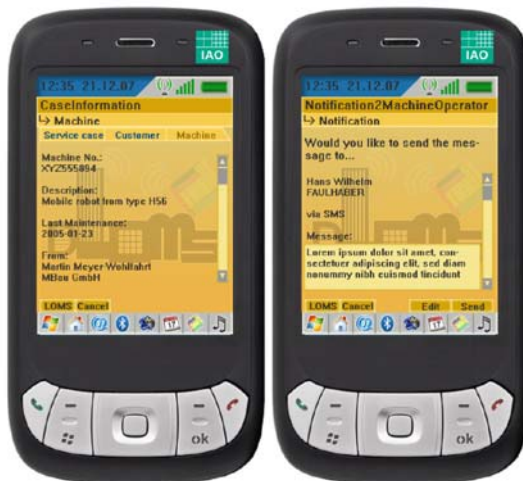
Figure 5a/b: Machine Data and Notification

The next screenshot (figure 5a) offers information about a machine that is broken; this content is taken online via web service from the service management system of the service provider. The last screenshot (figure 5b) offers the opportunity to send a notification about the acceptance of the service case to the client who requested the repair action.