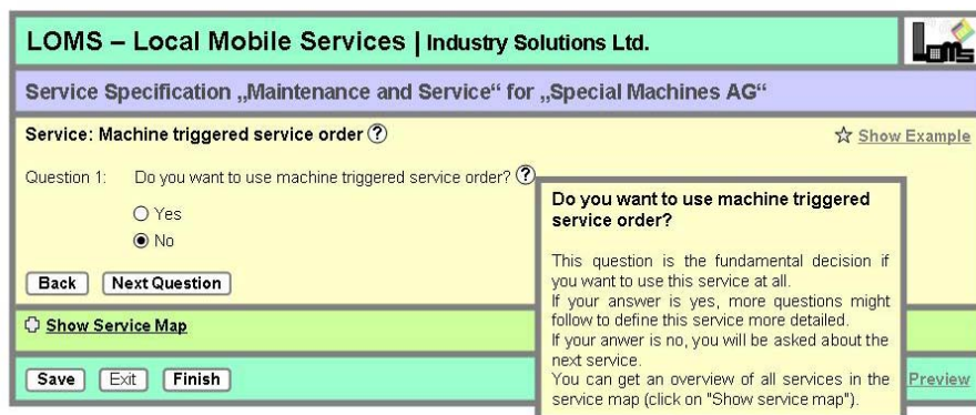
Figure 2: Service Specification Questionnaire: Sample Question and Help

In figure 2 the overall structure of the user interface is visible, with the name of the service operator (Industry Solutions Ltd.) in the first line and the name of the questionnaire (Maintenance and Service) as well as the Service Provider (Special Machines AG) in the second line. In the main section, the described service and its related questions are presented, including an explanation for the current question. It is always possible to save the current status of the questionnaire, as well as to exit or finish it in the bottom line.