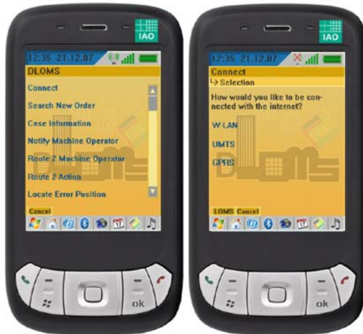
Figure 4a/b: Service Overview and Network Connection

The next screenshot (figure 5a) offers information about a machine that is broken; this content is taken online via web service from the service management system of the service provider. The last screenshot (figure 5b) offers the opportunity to send a notification about the acceptance of the service case to the client who requested the repair action.